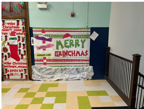
New floor on the 300 level