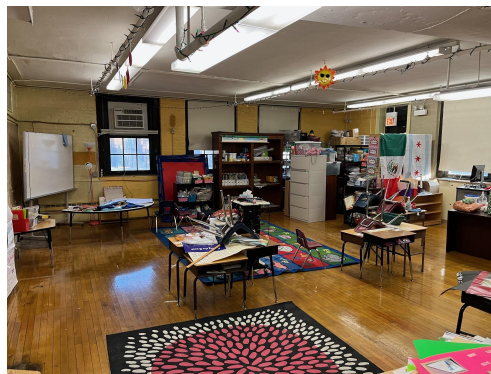
New design for room 001