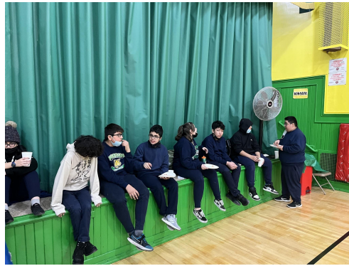
Science fair winners