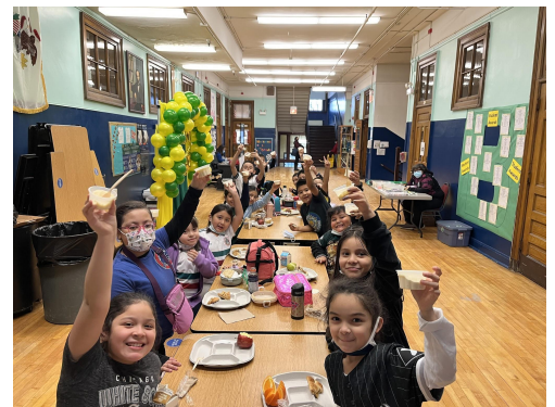
Spirit Week Celebrations