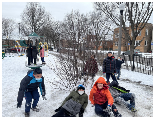
Fun at Recess